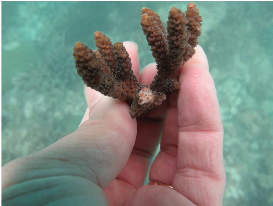
Figure 2. Mature (colored) oocytes are clearly visible in the branches of Acropora colonies.