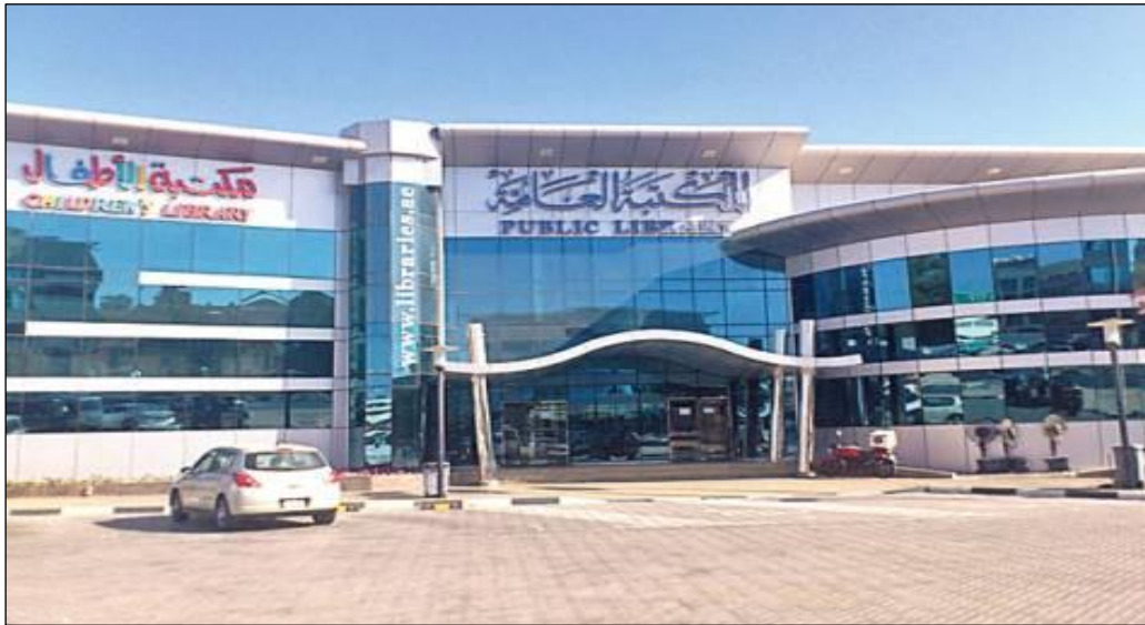
Figure 3: AlMankool Public Library outside view