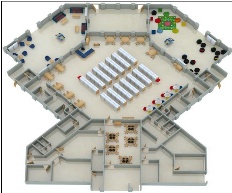
Figure 9: Al Wathba Public Library- Indore design