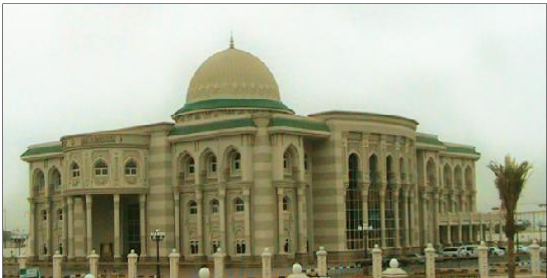
Figure 4: Sharjah Public Library- Main Library

To join as a member a patron would pay AED 160 as a deposit for lifetime membership and can access both print and electronic resources at the library and from home. Sharjah library visitors and members enjoy access to electronic resources for both Arabic and English language documents. The databases include: MEDLINE for medical and health sciences research articles, E-Marefa, books in Arabic, Credo reference provides books in various subjects and topics while The Great Mosque has classic archive books from 1820 to 1914 about religion and Arab heritage. In addition the Sharjah Library has a collection and facilities for individuals who are visually impaired.