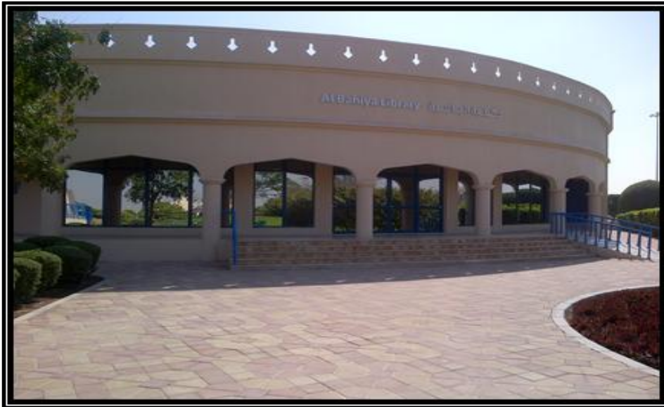
Figure 6: Al Bahia Public Library

Khalifa Park was launched in March 2013. It is located in the new neighbourhood in Abu Dhabi Island inside a park. It occupies an area of approximately 1500 square meters. The collection includes special and rare collection, Children’s library, dissertations and thesis, general collection books fiction and non- fiction.