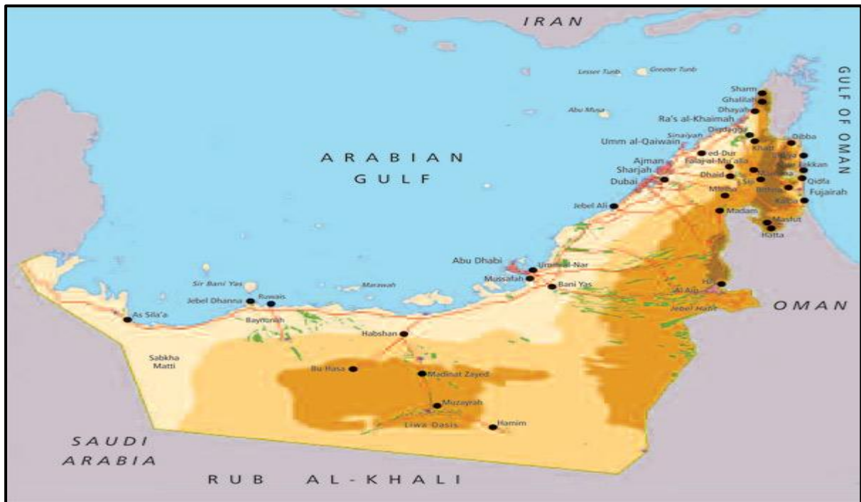
Figure1: Map of the United Arab Emirates