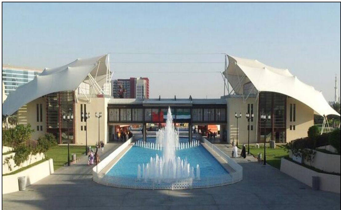
Figure 7: Khalifa Public Library

Khalifa Park was launched in March 2013. It is located in the new neighbourhood in Abu Dhabi Island inside a park. It occupies an area of approximately 1500 square meters. The collection includes special and rare collection, Children’s library, dissertations and thesis, general collection books fiction and non- fiction.