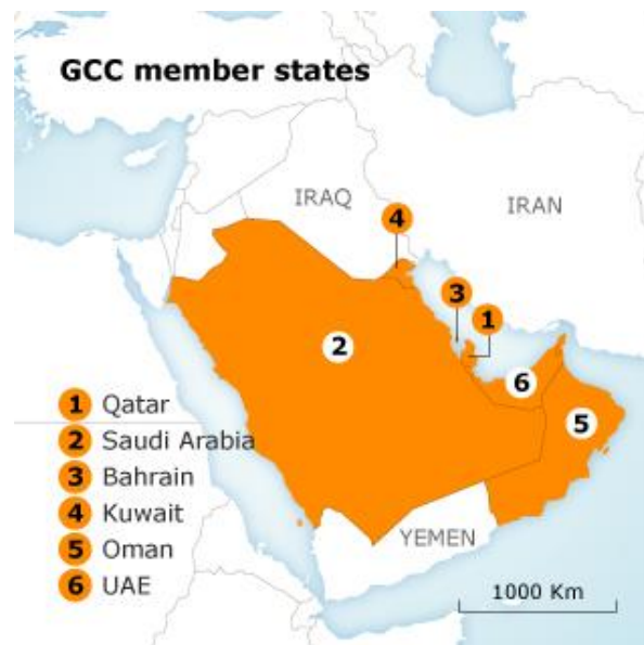
Figure 1. GCC Countries Map

The GCC countries are classified as developed countries because of their Gross National Income. The main revenue of these six countries depends on oil production and export since 1970. The GGC countries produce around 45% of the world's oil and provide around 25% of crude oil exports [24]. Most recently, almost all these countries have embarked on initiatives to diversify their income streams away from oil production and export.